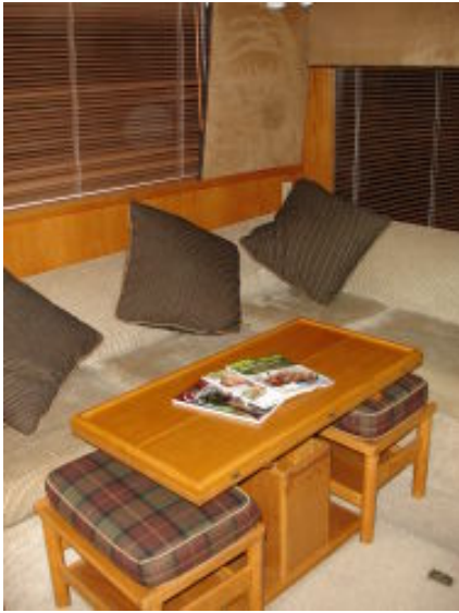
Main Salon Aft