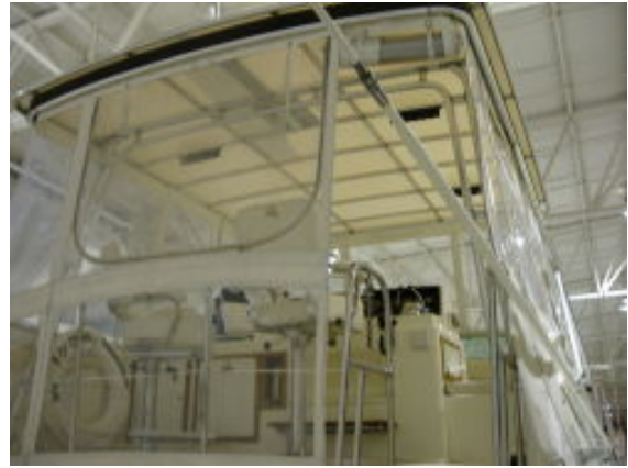
Flybridge Aft Looking Up