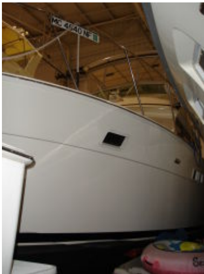
Bow Profile Port