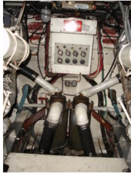
Engine Room Aft