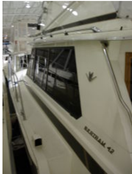
Port Side Deck Forward