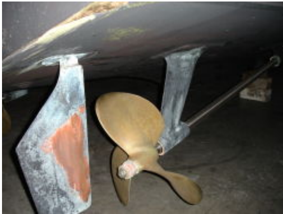
Starboard Rudder & Wheel