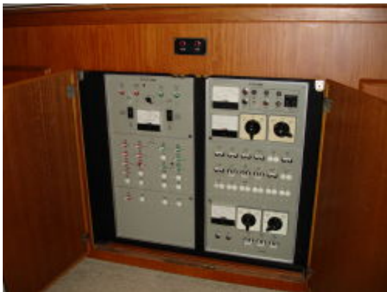
Electrical Distribution Panel