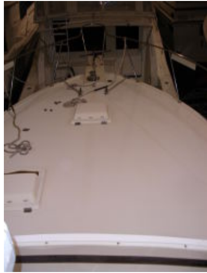
Bow Forward From Flybridge