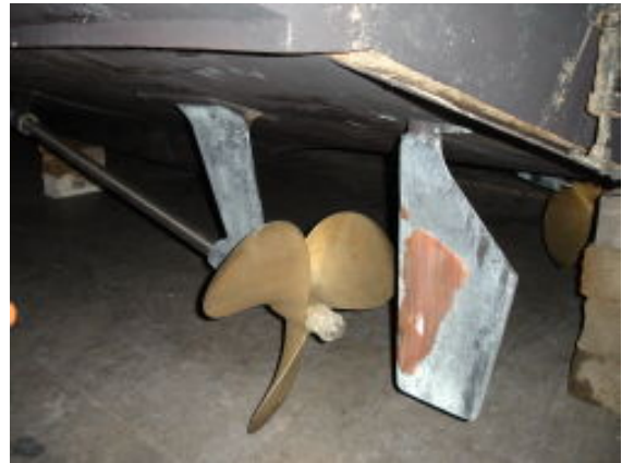
Port Rudder & Wheel