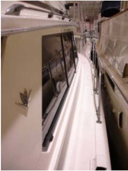
Starboard Side Deck Forward