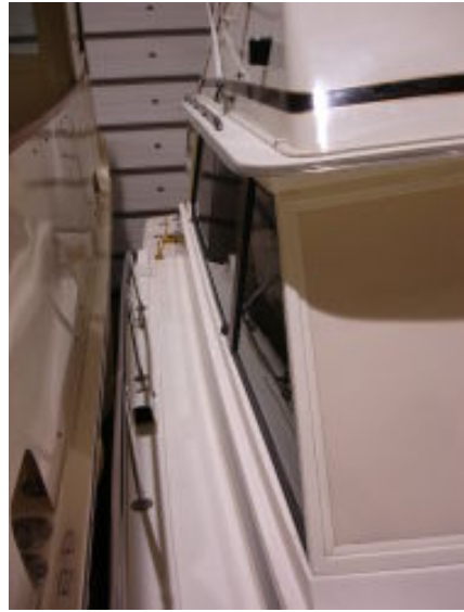
Starboard Side Deck Aft