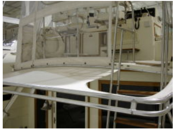
Cockpit Spray Skirt