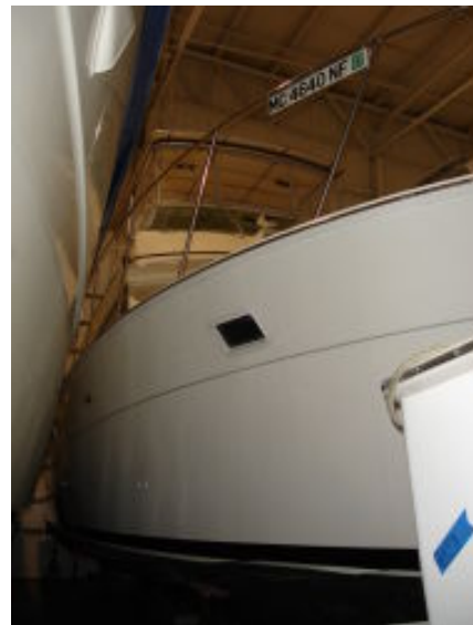
Bow Profile Starboard